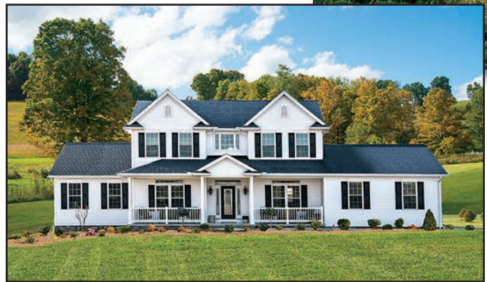
Final color corrected and retouched CMYK Tiff image for printing